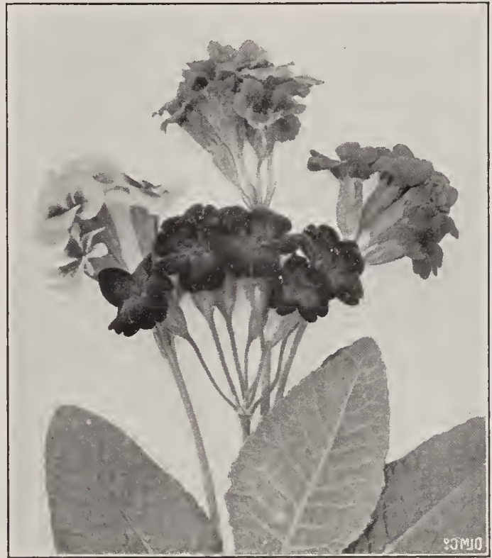
PRIMULA VERIS ELATIOR GIGANTEA

* Vulgaris florepleno alba. Type exactly as above with double white flowers. 40c. each, $3.50 per 10, $30.00 per 100.